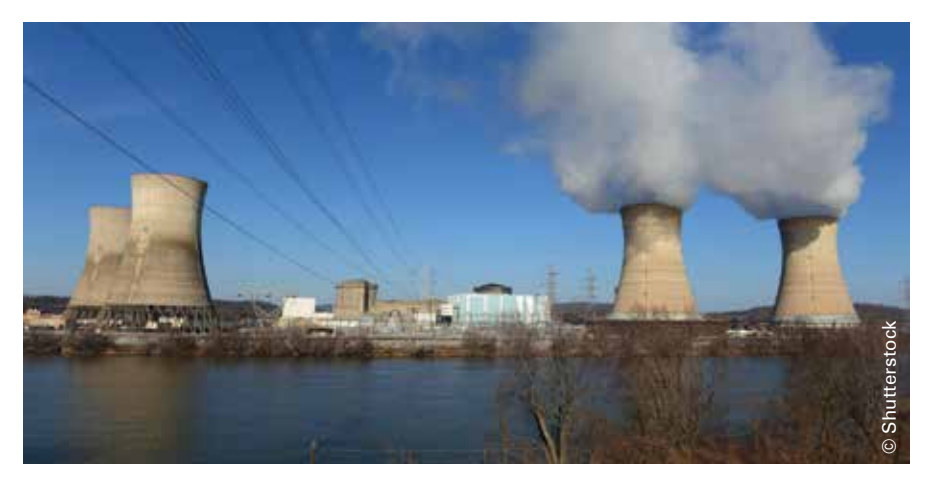
Three Mile Island Nuclear Power Plant

The effect of applying these design safety principles (see Table 1) is to simplify the complexity of the design at a system level, so that for any given fault or hazard, its progression and the barriers in place