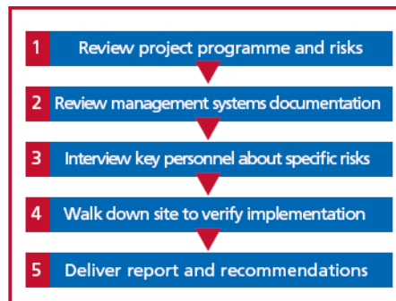
Figure 2 – Approach to risk-based auditing

The typical steps of the "vertical slice" method that Risktec takes are shown in Fig. 2.